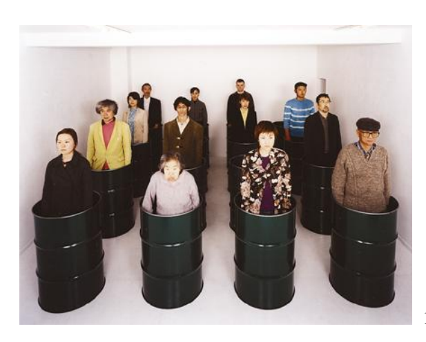
16 Drum Cans + 16 People, 2002