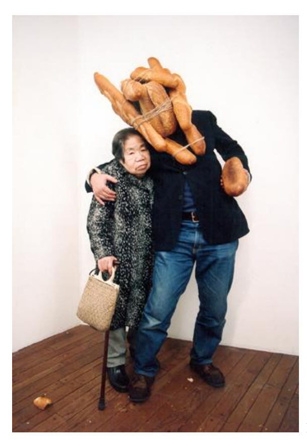
Bread Man Son + Alzheimer Mama, 1996