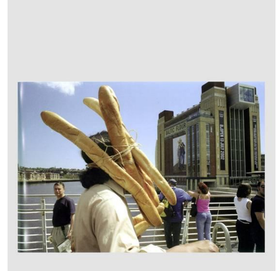
BALTIC U.K. 2002 21mX?