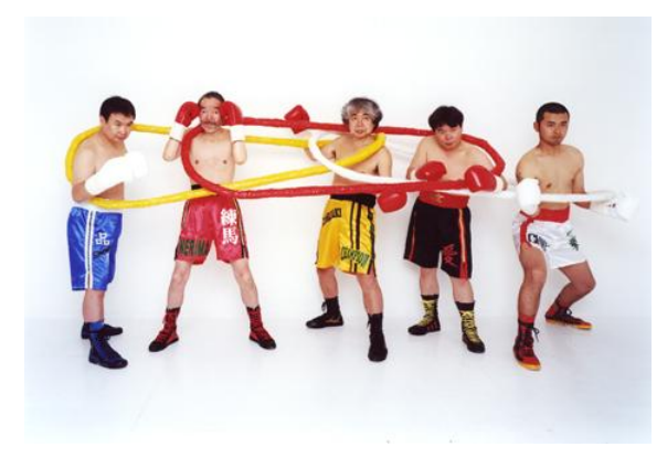
Boxing Partner, 2003