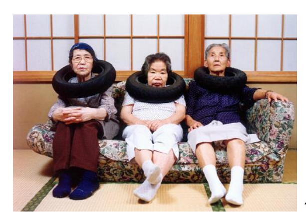
Tire Tube Communication, 1996