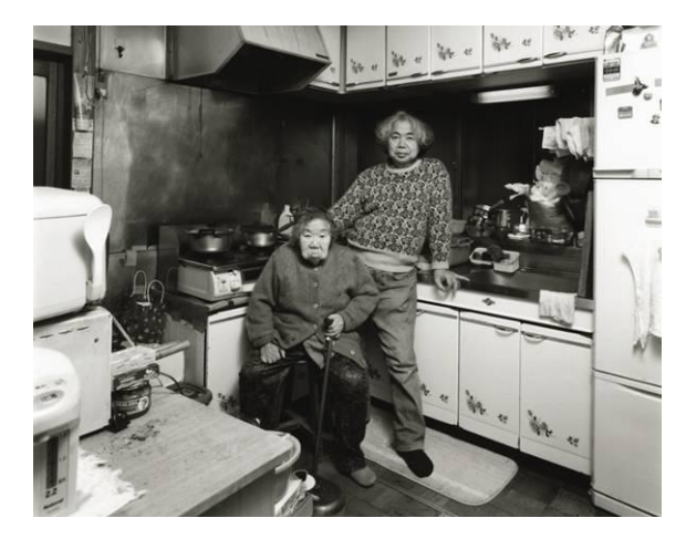
Mother and Son, 2005

Drawings: around 200 original drawings were selected to compose this exhibition. They transfer a sensitive and instigate palette of Tatsumis artistic input, which deal sometimes as inspiration for the performances or documentation of the process.